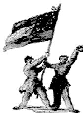
The Southern Spirit

The Southern people are the descendants of men who marched twenty miles in the heat of August, subsisted on rations that would not fill the belly of a child, fought an enemy that outnumbered them three-to-one, and won the day. They are a patient people, jealous of their freedoms, and determined to succeed.