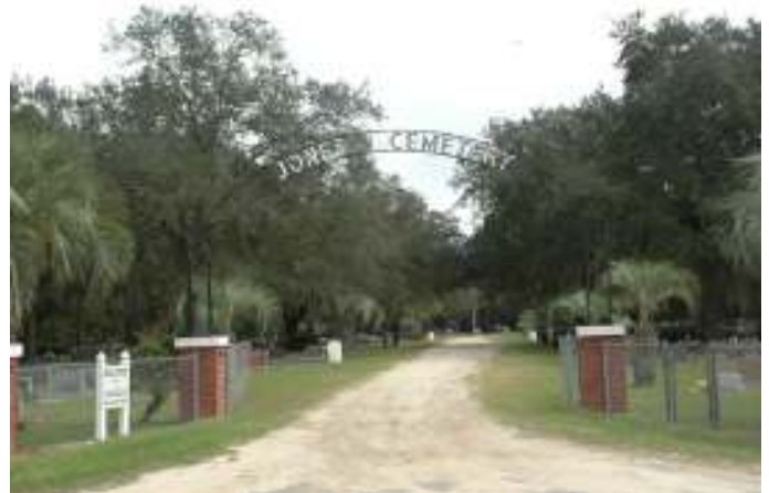
Above: Jones Cemetery, Nassau County, Florida