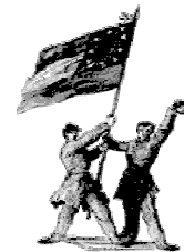
The Southern Spirit

Can we say the victor of the struggle for independence that took place so many years ago has indeed provided that truth and justice to the posterity of this union?