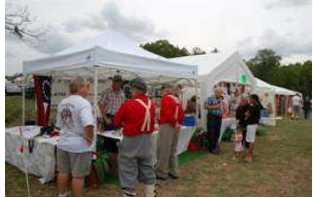
SCV Camp 745 tent featured at last year's festival

Oh, would that Mr. Lincoln had paid more attention to his predecessor. The Southern Nation might today have been spared the horrors of war and enjoy the freedom and independence she coveted so dearly.