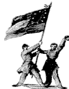
The Southern Spirit

The citizen-soldiers who fought for the Confederacy personified the best qualities of America. The preservation of liberty and freedom was the motivating factor in the South's decision to fight the Second American Revolution . The tenacity with which Confederate soldiers fought underscored their belief in the rights guaranteed by the Constitution. These attributes are the underpinning of our democratic society and represent the foundation on which this nation was built.